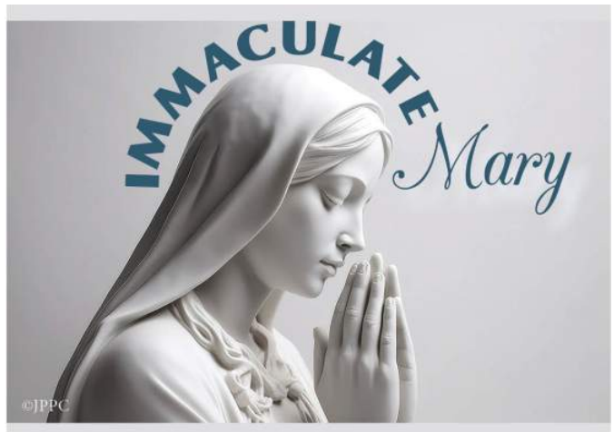
The Most Holy Name of Mary September 12, 2024