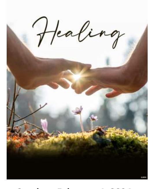
Sunday, February 4, 2024

REGISTRATION: We extend welcome to all new parishioners and invite them and any others, who have not yet registered, to become members of the St. Edmund's Parish Family. Please contact the Rectory Office for a Registration Form.