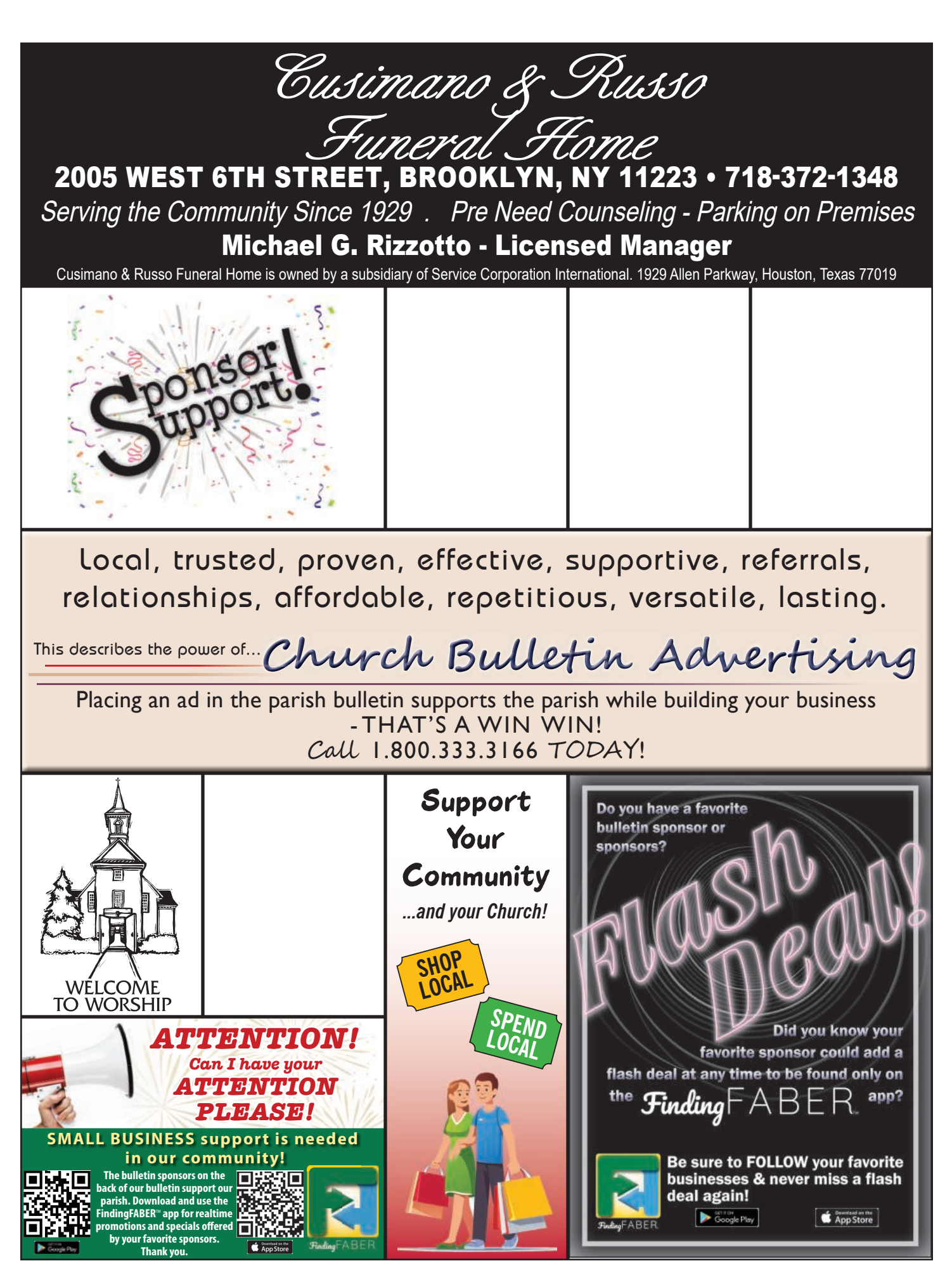
433 - St. Edmund, Brooklyn, NY (i)