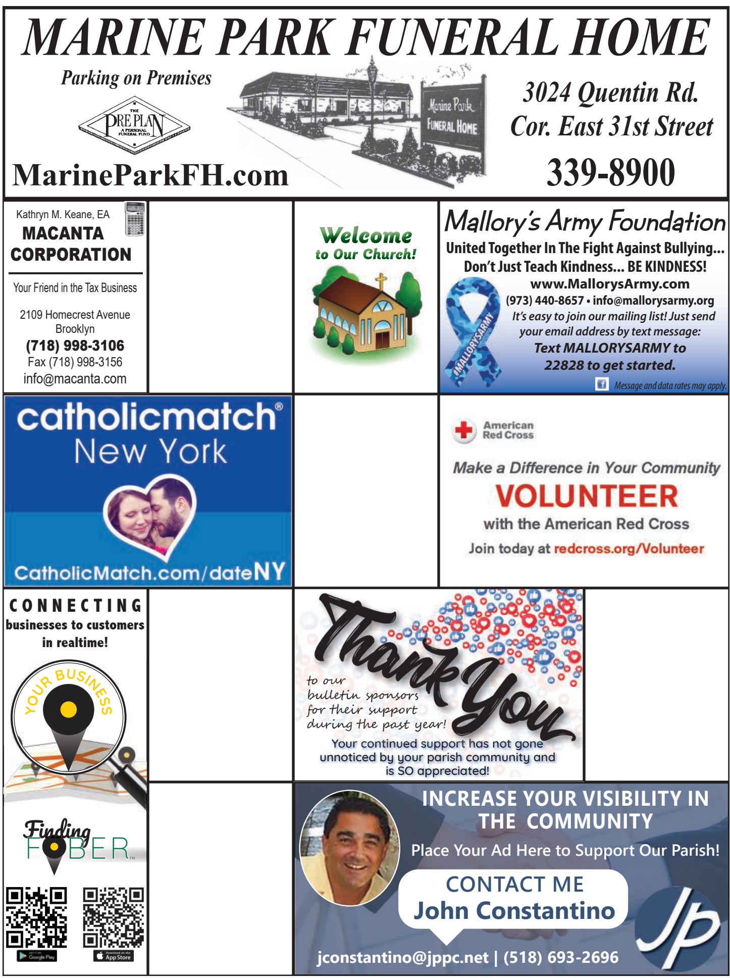
433 - St. Edmund, Brooklyn, NY (b)

John Patrick Publishing Company, Inc. (800) 333-3166 www.jppc.net