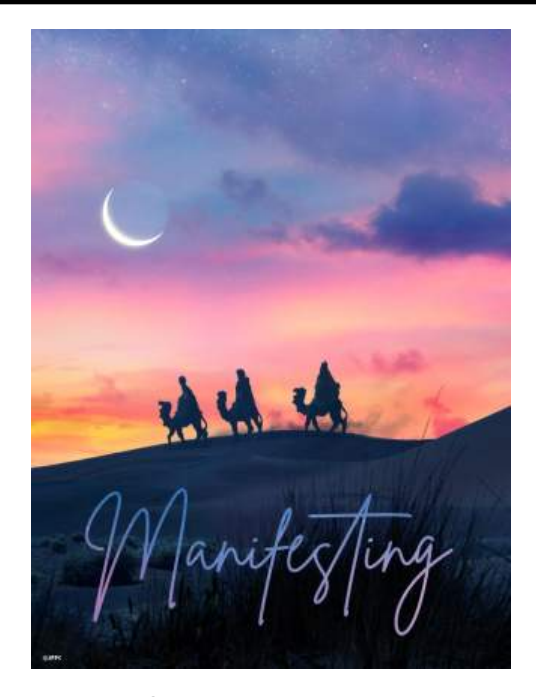
Sunday, January 7, 2024

REGISTRATION: We extend welcome to all new parishioners and invite them and any others, who have not yet registered, to become members of the St. Edmund's Parish Family. Please contact the Rectory Office for a Registration Form.