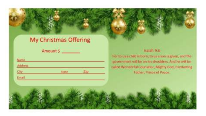
"Christmas Offering To The Church"

If you were away there is still time to make a donation to the Church for Christmas. Envelopes can be found in your current set or you may obtain one on the radiators