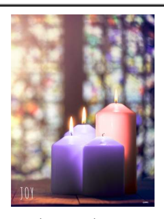
Sunday, December 17, 2023

REGISTRATION: We extend welcome to all new parishioners and invite them and any others, who have not yet registered, to become members of the St. Edmund's Parish Family. Please contact the Rectory Office for a Registration Form.