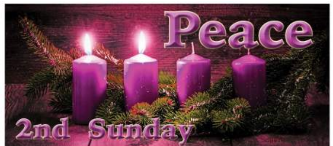
Lighting of the Advent Wreath

Exposition of the Blessed Sacrament and a Holy Hour will be held each weekend during Advent one-half hour prior to the Masses on Saturday evening and Sunday.