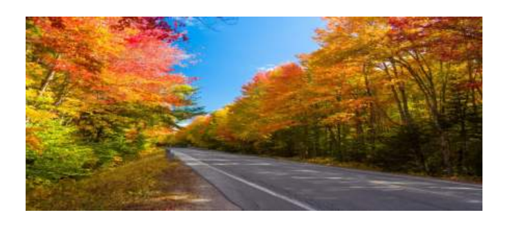
Daylight Savings time ended Sunday, Nov. 5th

"The Book of the Dead" containing the names of all our parishioners, who have gone to their eternal rest during this past year, will remain enshrined for the month of November.